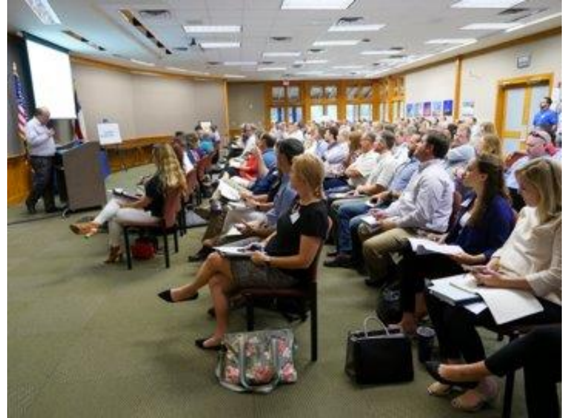
TWDB flood outreach meeting in Bastrop, TX.