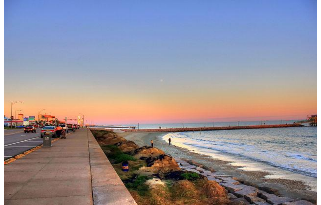
Galveston Seawall, a structural flood mitigation solution.