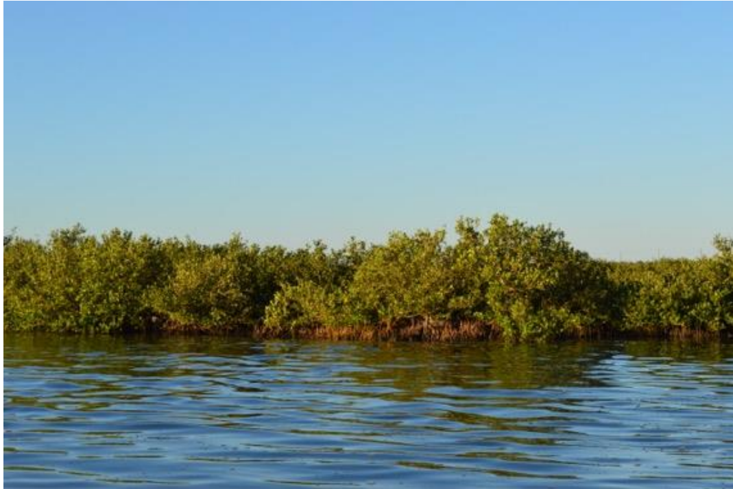
Mangroves on the Texas Coast stabilize shorelines and help absorb storm surge; an example of a non-structural flood mitigation solution.

The implementation of actions, including both structural and non-structural solutions , to reduce flood risk to protect against the loss of life and property.